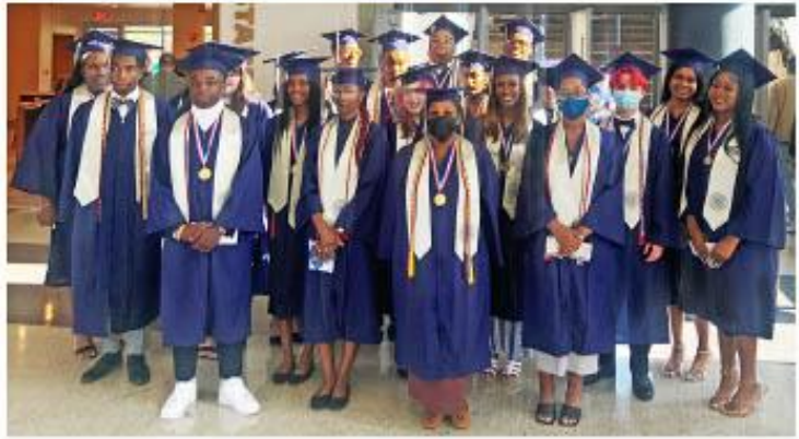
This year, 27 PPS seniors earned their associate's degree from TCC while still in high school.